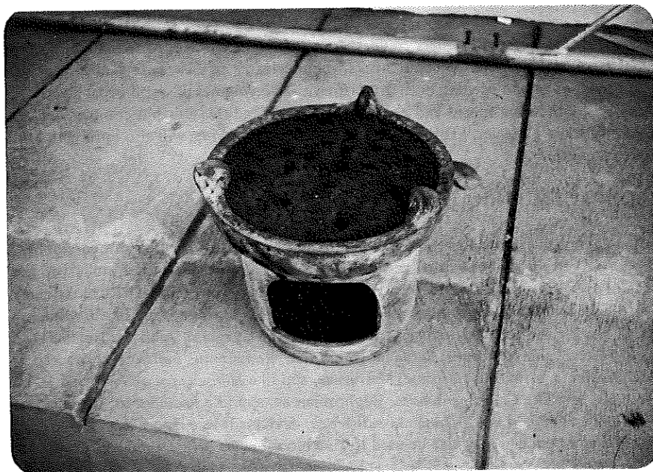
A biobriquet casted in a traditional earthen brazier costing US$0.50. Burning the brazier briquet and burning biomass in the ash compartment of the brazier will convert it into a hybrid stove.